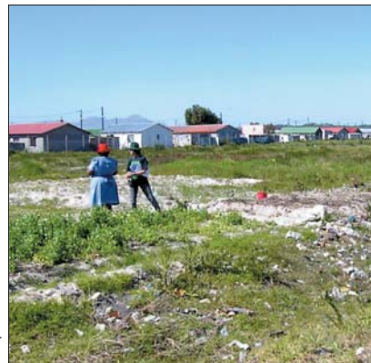
Imizamo Yethu, 2001: Before →

Six members, all mothers, began as home gardeners who later approached the Chris Hani High School for land. Building on the skills gained from working in their home gardens, this group has developed a sizeable garden. Well situated opposite the Makhaza Community Centre, the women sell vegetables on a daily basis to passing trade.