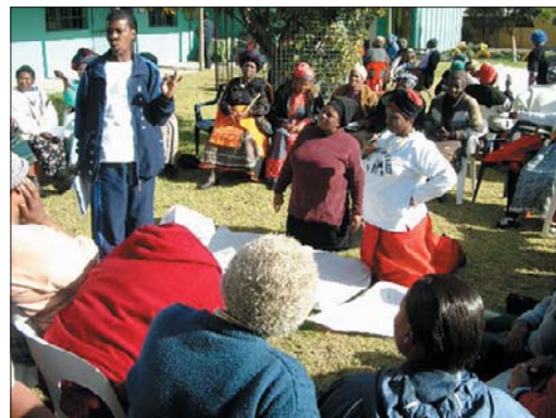
Members of the Vukuzenzele Farmers Association plan their structures and way forward – March 2003.

The name Vukuzenzele means to “Wake up and do something for yourself!” Members of the association, sporting T-shirts declaring their identity, were present and vocal at the City of Cape Town’s 2003 Urban Agriculture Summit in Khayelitsha! We watch with much joy and pride as this pioneer association finds its feet, and we are honoured to provide assistance and guidance wherever possible.