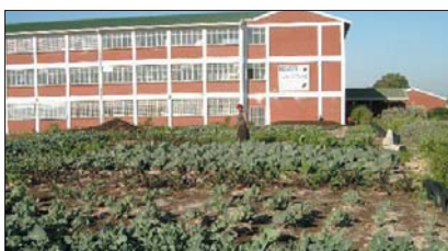
Masizame Group Gardens at Hlanganiso School – 6 families, established in August 2002.