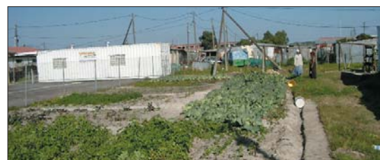
Imizamo Yethu Educare Centre: Feeding scheme garden, this educare centre is run voluntarily by 4 amazing women.