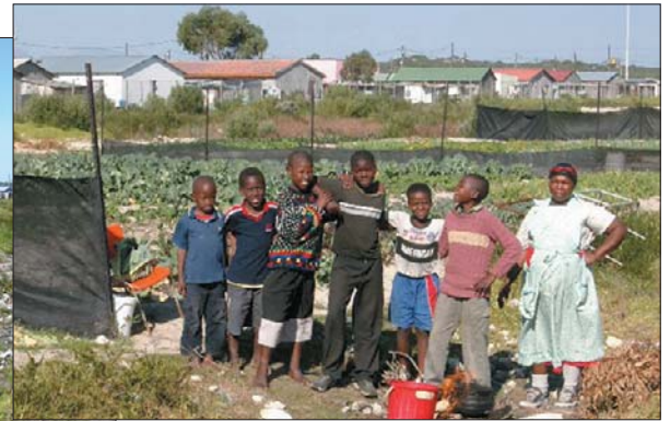
Imizamo Yethu, 2003: After