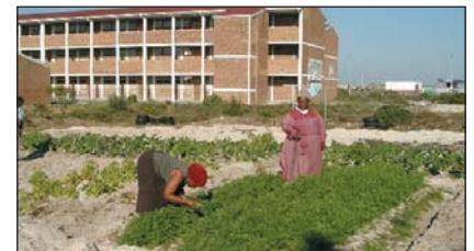
Tsikarong Group at Bulomko School: Established in August 2000, these 4 women are feeding their families on delicious organic vegetables!