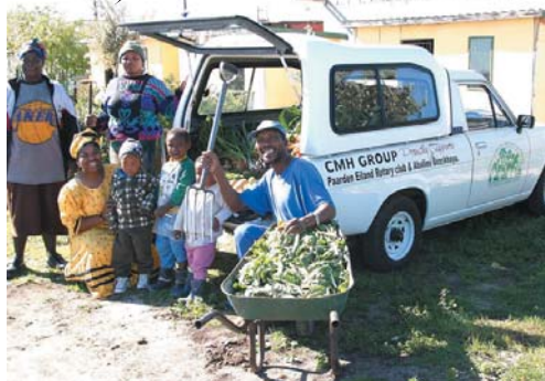
Follow-up support in our new bakkie, fondly nicknamed our “Baby Nissan”!