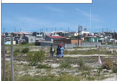
Ikhwezi project, 2002: Before

Ikhwezi Project is made up of nine mothers. Their organic vegetable garden is based at Kwamfundo High School in Harare. The women also have a weaving project where they make place mats and carpets. Between the gardening and weaving project, these members are feeling the difference of "self-help" in their own lives.