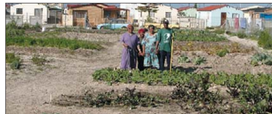
Bambanane Group at Sivuyiseni School: A vibrant new group of 7 families (5 women and 2 men). Established in August 2002, aiming for market garden status.