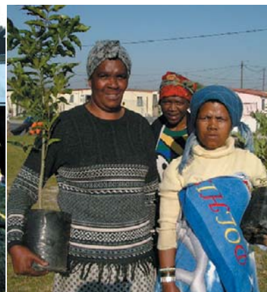
Arbour Week tree planting build up event – Mfuleni Community, 21 & 28 June.