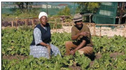
Sakhe Group at Nomsa Mapogwane School: Established in 2000, the pioneer group is now moving to bigger land. They are in the process of handing over to, and training, a new group!