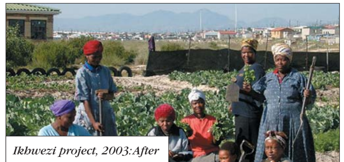
Ikhwezi project, 2003: After

Ikhwezi Project is made up of nine mothers. Their organic vegetable garden is based at Kwamfundo High School in Harare. The women also have a weaving project where they make place mats and carpets. Between the gardening and weaving project, these members are feeling the difference of "self-help" in their own lives.