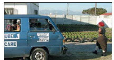
Nonqubela Educare: Feeding scheme garden, established in August 2002.